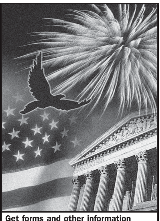
Get forms and other information faster and easier by: Internet IRS.gov